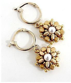
14) You can bead earrings