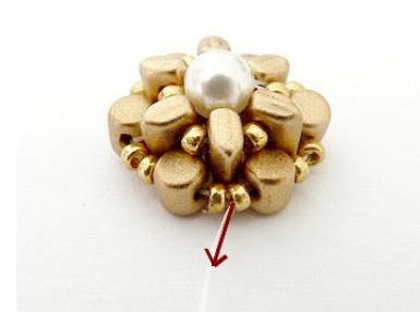
10) You'll now have this Exit like picture through the first R15