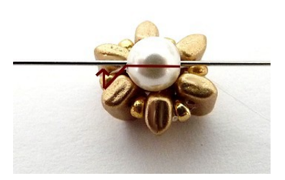
5) Pass again through PR4 and R15 in the opposite way