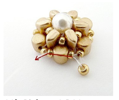
11) Pick up 1 R11 between each R15, repeat for the length of the pattern