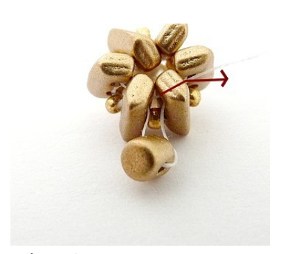
7) Pick up 1 Minos between Piros, repeat for the length of the pattern, you bead on the back of your work