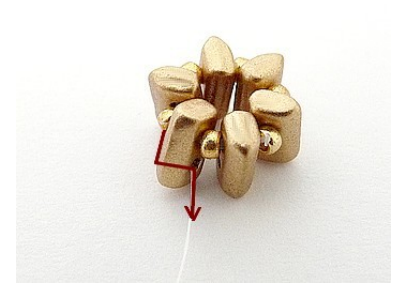
2) Exit like picture