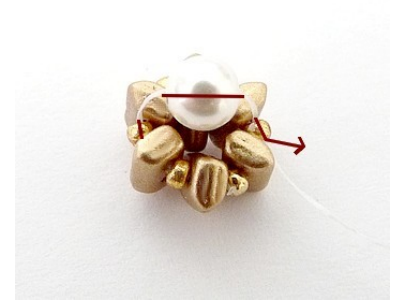
4) Pick up 1 PR4 and exit through R15