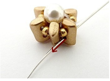
6) You'll now have this ② Exit like picture through Piros