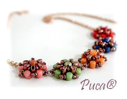
17) Necklace 5 flowers