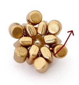
8) You'll now have this, exit through Minos