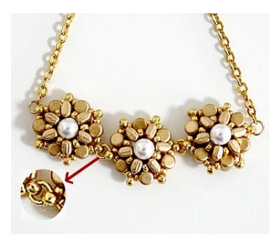
13) If you bead a necklace, put together 2 flowers with a ring between 2 R11, like picture