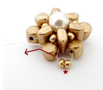
9) Pick up 2 R15 between each Minos, repeat for the length of the pattern