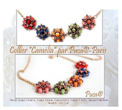
18) You can bead several flowers according to your wishes!

Happy beading! Thank you for respecting my work ©