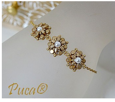
15) Or a bracelet with 3 flowers